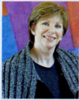
WORDS BY WENDY LEVY